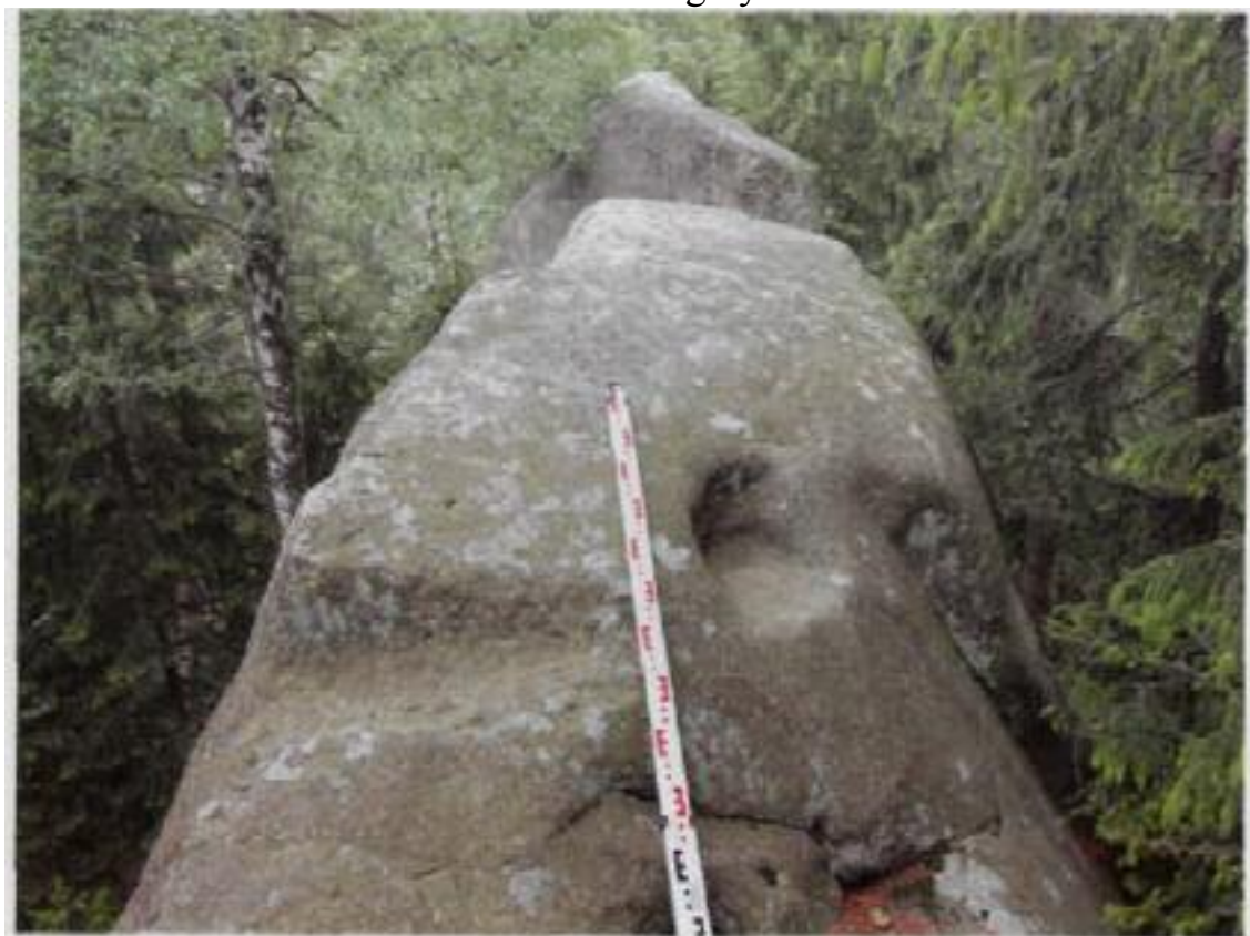
“Lesivski stone” - Vrubi is on the top of rocky platform