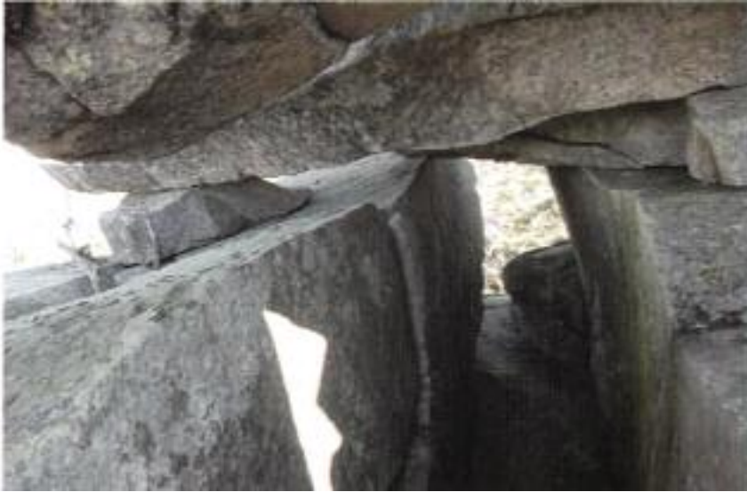
Ceiling to the tunnel

But will look at these photos and it will be clear you, that processed stone very high-quality instruments (wonders of photo of N. Kugutyak).