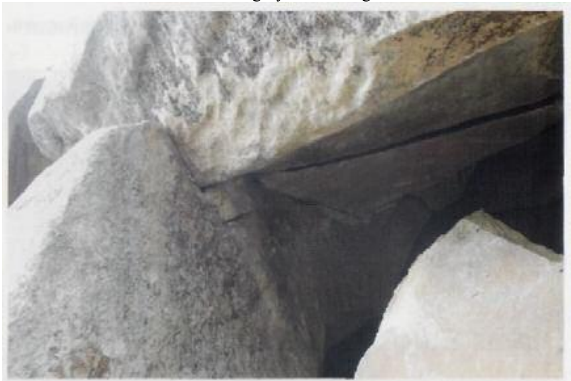
Vrub and pidpora of one of overhead flags of ceiling to the tunnel

And count us nobody will be able to argue that it is artificial education which has the very not simple setting. You only to see on the location of this construction