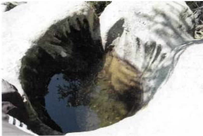
So-called «sacrificial bowl», and in actual fact tracks of establishment of devices

You only look at these stone in Carpathians: