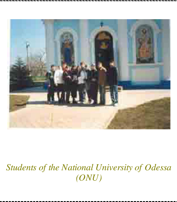
Students of the National University of Odessa (ONU)

( , 14.01.2005 . . ) « - » 6 1822 :« , , ;